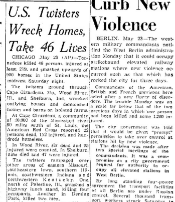
The twisters raged over other areas of eastern Missouri, northeastern Iowa, southern Illinois, southeastern Indiana and northwestern Kentucky.